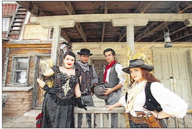
Old Tucson cast members entertain with a variety of reenactments and demonstrations, including stunt and musical. Old Tucson has hosted over 300 television and film productions since 1939.