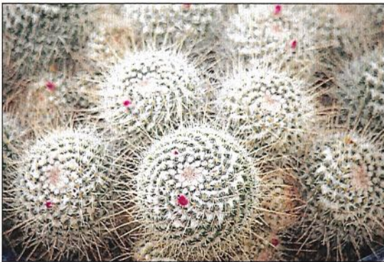
Cacti are abundant at the Arizona-Sonora Desert Museum.