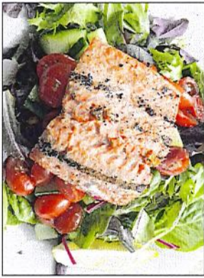
Wilko is located near the University of Arizona campus and offers a variety of fresh menu items.