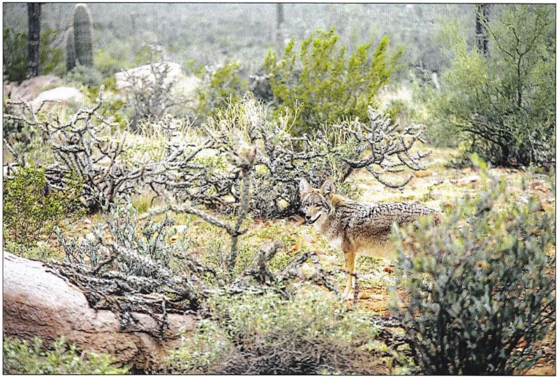
Desert wildlife, including a coyote, can be spotted within confined spaces of the Arizona-Sonora Desert Museum. Visitors may also see mountain lion, bear and javelina.