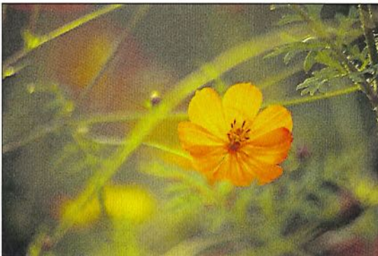
A variety of desert habitats and plants — over 56,000 — await at the Arizona-Sonora Desert Museum.