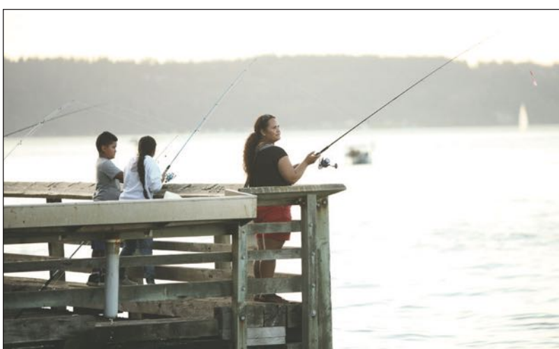
Recreational opportunities, including hiking and fishing, abound in Point Defiance park in Tacoma, the second largest urban park in the United States.