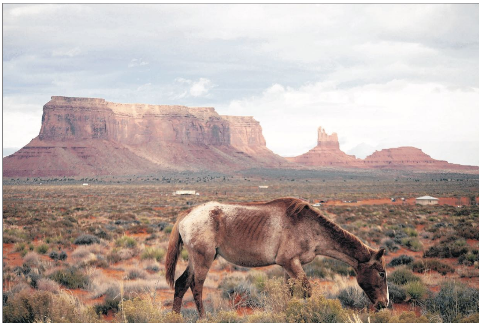
A wild horse grazes at Monument Valley, which straddles Arizona and Southern Utah. Visitors may drive through the park — long a popular site for film making — on a 17-mile dirt road.