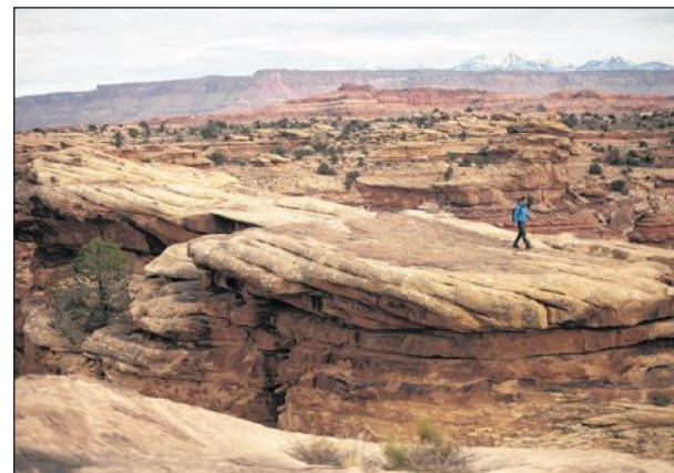
Superlatives fail to articulate the natural geologic splendor of Southern Utah.

There wasn't enough time to hit Bryce Canyon National Park and Zion National Park — this time — (we'd already crossed Arches National Park off our list a couple years ago) so someday we will return.