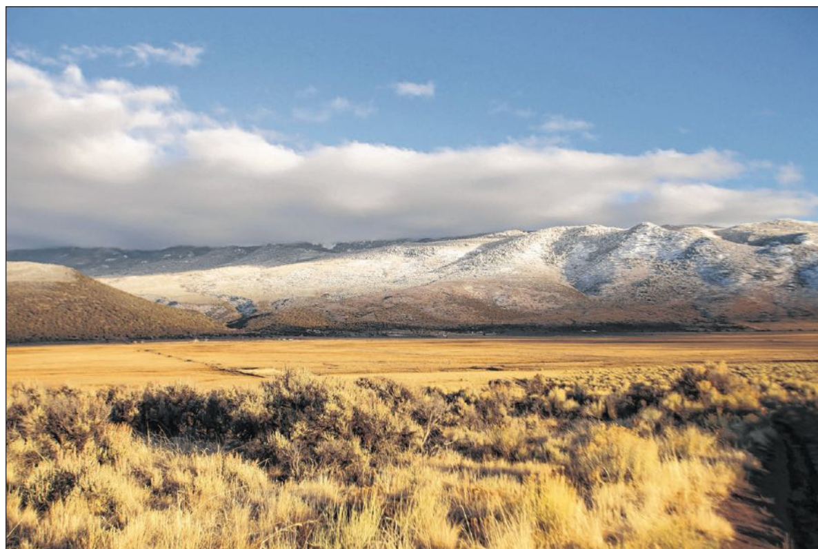
A colorful landscape of seemingly endless mesas, canyons and buttes makes Canyonlands National Park a popular recreational destination.