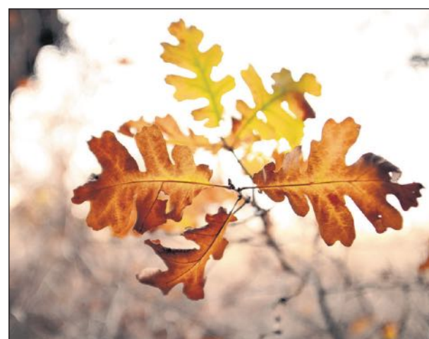
Autumn foliage decorates the landscape at Canyonlands National Park.