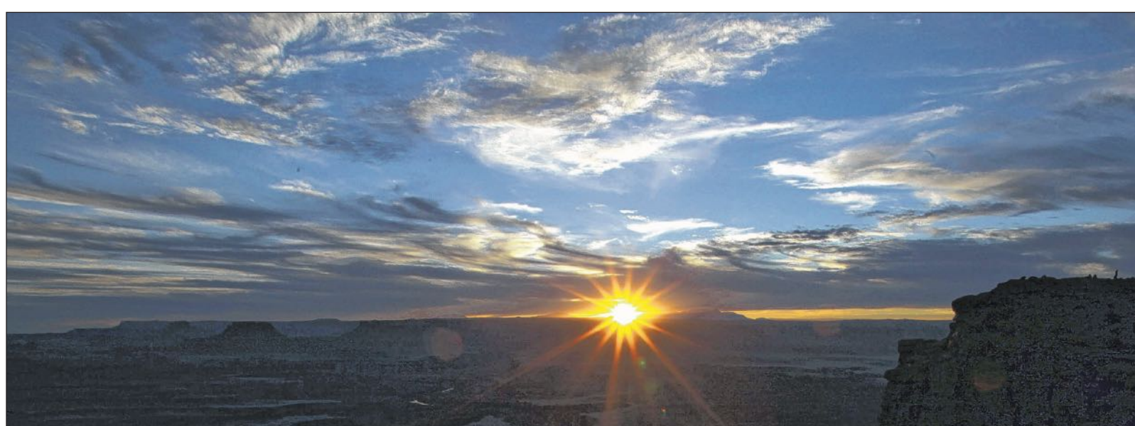
Dramatic skies accompany a setting sun in Island in the Sky, the most accessible district in the vast Canyonlands National Park.

More information: tinyurl.com/yccurz6u .