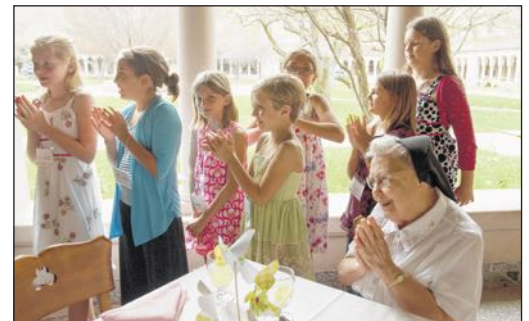
Charm school students entertained the sisters with a song during lunch.

PostBulletin.com To view a gallery of images from the garden party