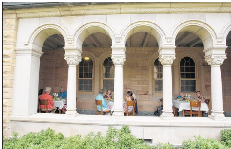
Exterior columns of the Assisi Heights Inner Courtyard frame the students and sisters during the lunch.